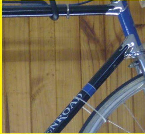
Continued Page 2...