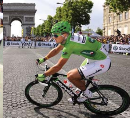
Above: Thor Hushvold won the Green Jersey at the 2009 TdF