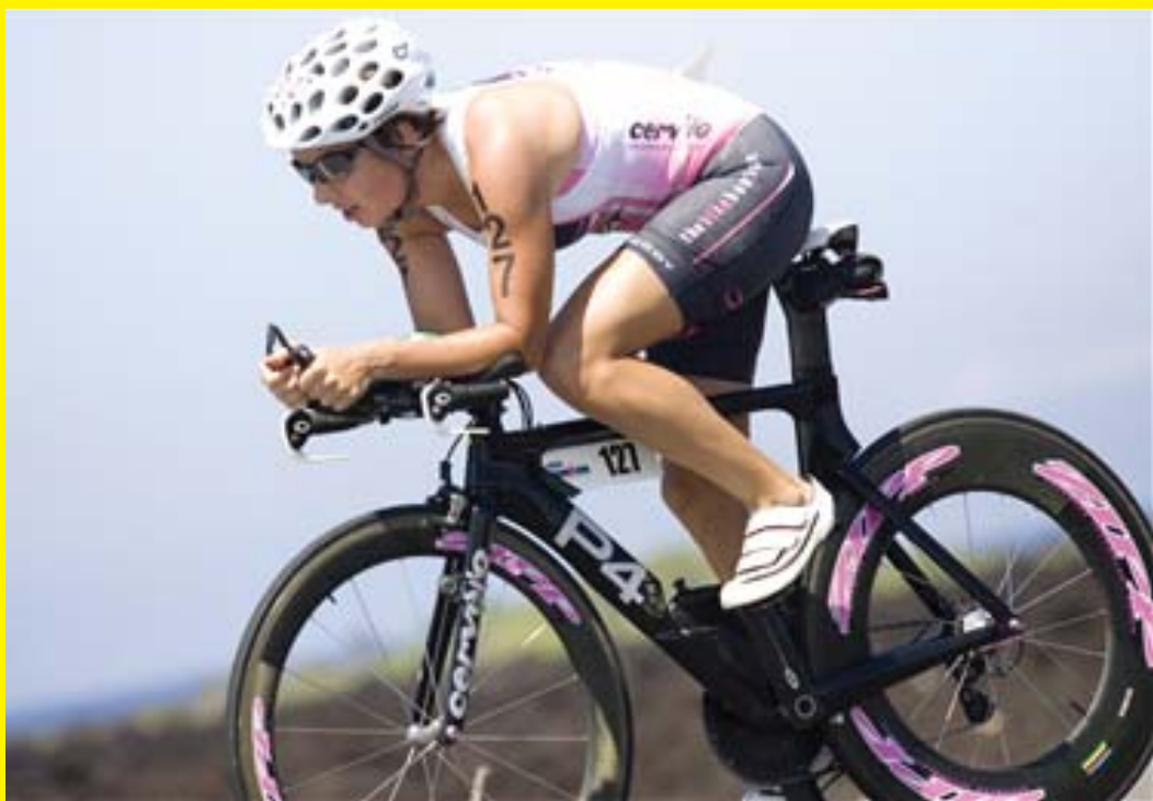
Cervelo's P4 is the popular Ironman choice!