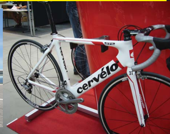
Above: The 2010 Cervelo S2 bristles with goodies from the world's best