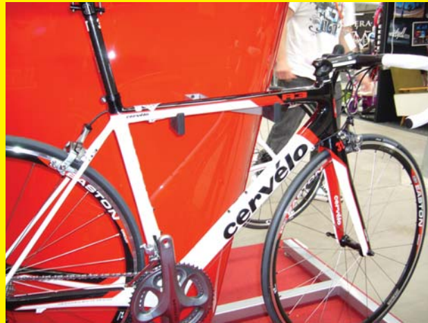
Above: The 2010 Cervelo R3

Cervelo's 2010 bike range has been released and Australian delivery is just around the corner. Pricing is significantly lower than 2009 while specs look to be great with Sram Red, Shimano Durace 7900, Ultegra 6700, 3T (bars, stems and seatposts) and Fulcrum wheels featured. Meanwhile our remaining 2009 bikes are on sale at very attractive prices (while stock lasts - a cliché I know but true in this case!) check them out at www.croydoncycleworks.com.au